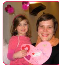
Protecting What Is Precious

Date: Tuesday, February 14, 2012 Time: To be announced Location: Minnesota State Capitol, St. Paul