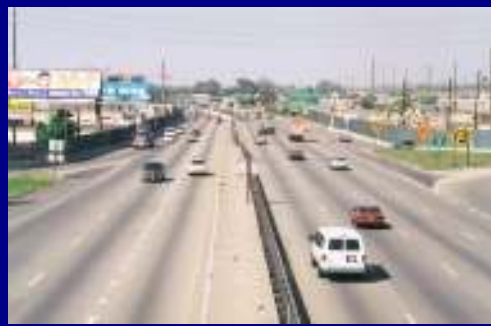
A Day During Port Closure