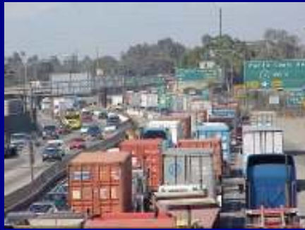
An Average Day