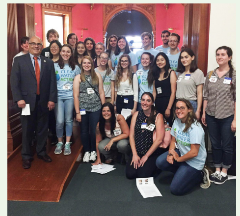
Clean Water Action's Canvass brings the issues straight to legislators in Trenton at our Stop Dirty Pipelines Lobby Day.

43 Democratic and 7 Republican legislators have already signed a letter urging NJDEP to deny a key water quality permit it needs.