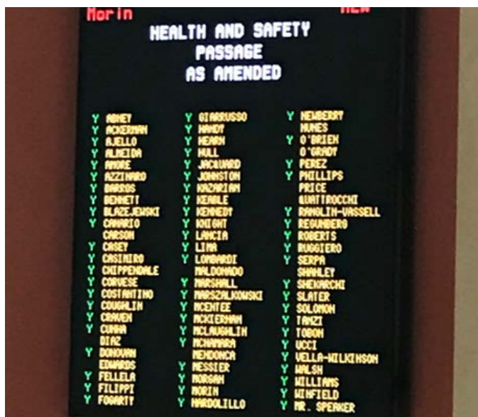
▲ Victory! The vote count as Rhode Island passes H5028, banning Flame Retardants.

In response to a major push led by Clean Water Action, health experts and firefighters, the Rhode Island House of Representatives voted to pass H5082 in special session this fall. The Senate had already unanimously passed this bill earlier in the session. Starting in 2019, Rhode Island law will require the phase out of organohalogen flame retardants (a group of chemicals that covers most of those used today) in items like couches, highchairs, electronic toys, car seats, and many more common household products. Rhode Island is the first state in the nation to ban the use of the entire class of chemicals in both furniture and children's products.