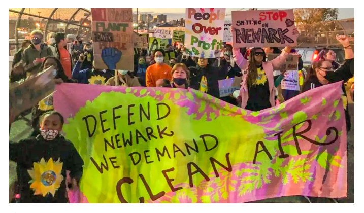
▲ Activists and residents rallying in Newark against proposed projects that would have added pollution to city neighborhoods.

After a fifteen-year wait, the New Jersey Department of Environmental Protection now has the power and mandate to deny permits for new polluting facilities, as well as set stricter conditions for existing permits and expansion. The final adoption of New Jersey's Environmental Justice rule is a milestone achievement and result of the unwavering dedication and advocacy of environmental justice organizations including Clean Water Action and concerned