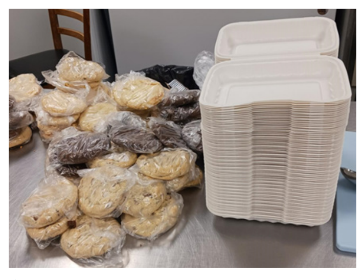
▲ Approximately 300 million tons of plastic waste (an amount equivalent to the weight of the human population) are produced every year (UNEP). Only 5–6% gets recycled due to cross contamination of other products and types of plastic, lack of markets et al.

Once Franciscan Charities move into their newly renovated building, meals can be served inside again, with dignity, on reusable plates with actual silverware, not plastic utensils, and beverages will be served in washable cups, not plastic water bottles. Switching to reusables is a huge win for everyone.