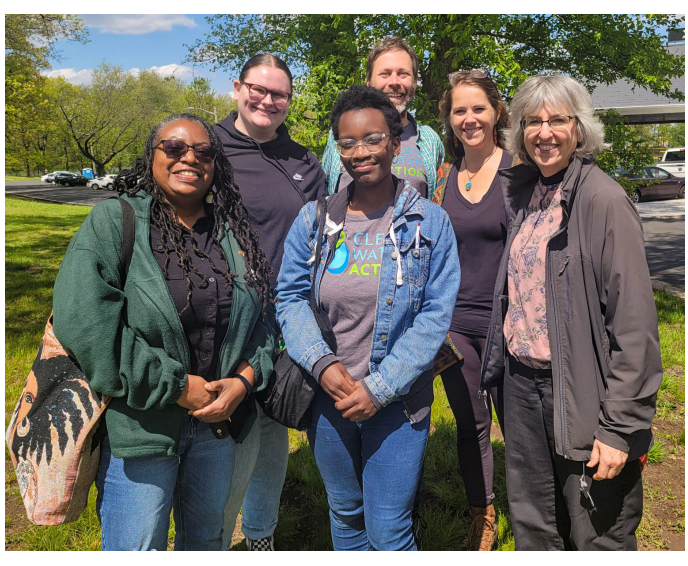
▲ Clean Water Action Team before embarking on Port of Newark Tour.

Clean Water Action has been exploring a myriad of solutions to address this issue including NJ adopting an Indirect Source Review (ISR) policy. ISR is a provision of the federal Clean Air Act that allows states to impose pollution control requirements at ports and warehouses as if they had one smokestack (like a power plant) instead of many tailpipes. Down the road we hope to adopt a NJ Clean Fleet policy