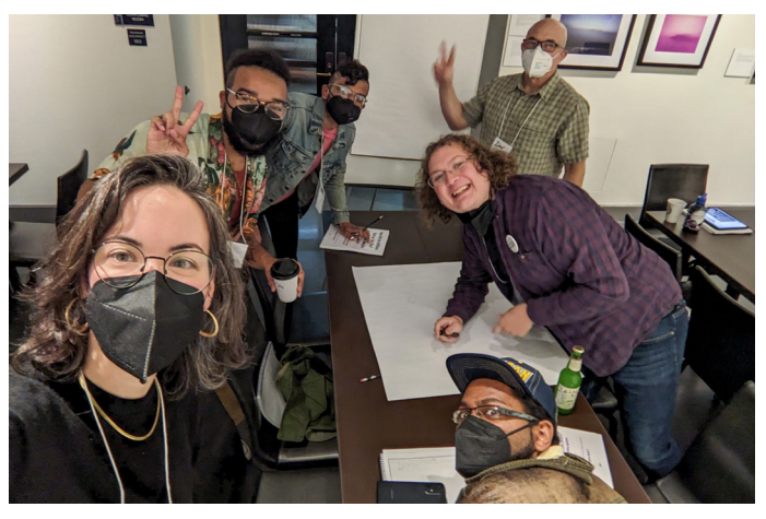
▲ Michigan Public Power Advocates mapping the history of DTE, our major Investor-Owned Utility in SE Michigan

Our work on energy democracy and municipalization is not limited to Ann Arbor though. Clean Water Action has been able to dig deeper on the issue of municipalization with our partners fighting for utility