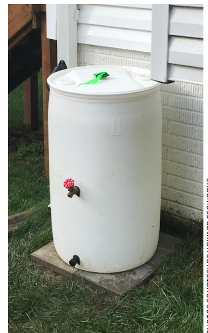
Rainbarrel preparation and installation.