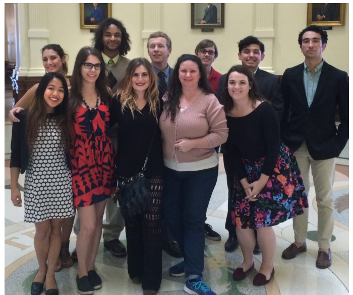
Clean Water Action canvassers lobbied legislators' offices on Texas Water Day, March 22

► ALERT: Gov. Abbott has summoned lawmakers back to Austin for a special session beginning July 18, and has directed them to pass a measure that would forbid cities from enacting local laws to protect trees. Please stay tuned for calls to action from Clean Water Action to stop such a measure from passing.