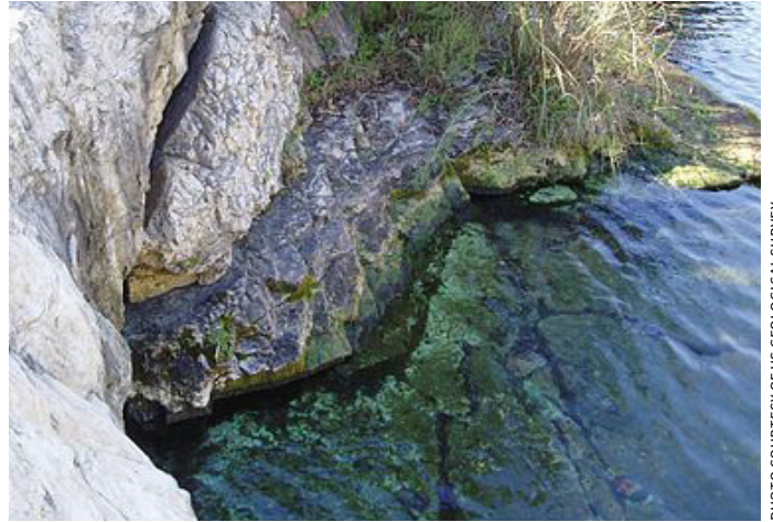
Barton Spring in Austin, Texas. The spring emerges to the surface from the Edwards Aquifer.

HB 3036 (Phil King) would have banned future permits for discharge while promoting land application and re-use of treated effluent as a viable, more sustainable alternative. Land application on prepared fields allows pollutants to be absorbed by